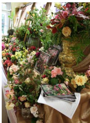
Heritage Rose Display