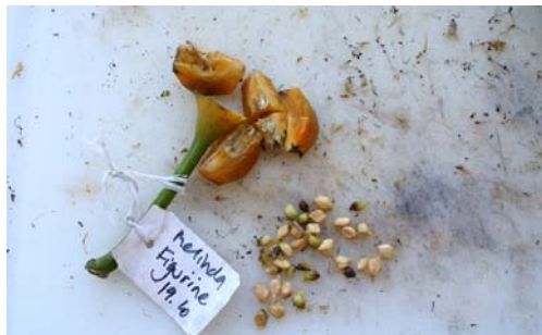
Cut the hips open and remove the seeds