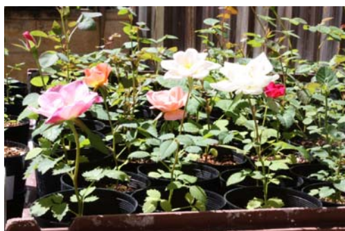
Every flower is unique—this is exciting!