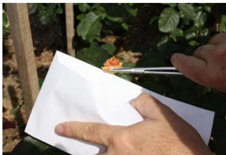
Removing the stamens with pollen