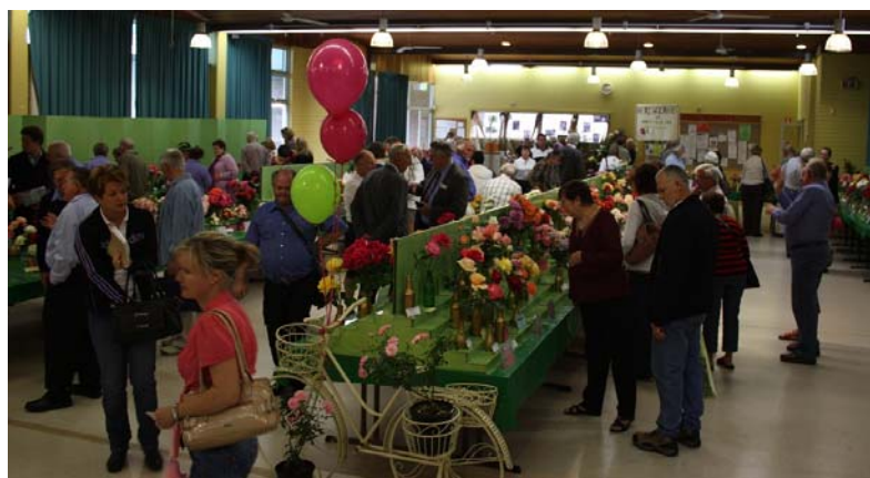
The Auditorium full of roses and visitors