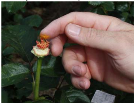
Pollenating with stored pollen