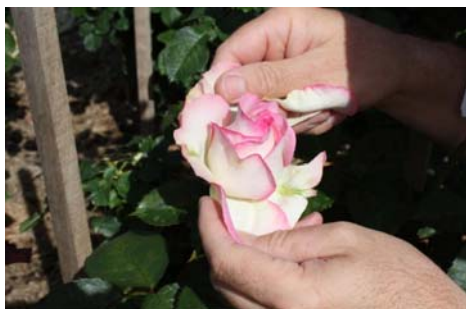
Removing the petals

Pollenate October—January. Cut the Hips 4 months after pollinating or when the colour is orange/red. Store the seeds in the fridge for 2 months, then plant them and watch your babies come alive.