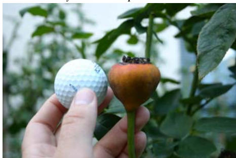
They won't all be this big, some will go red too