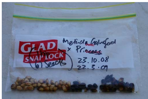
Store them in the fridge—Name Them!