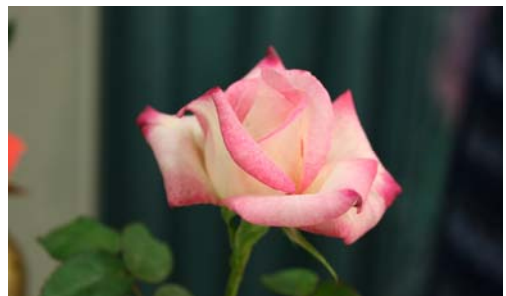
The seedling category for rose breeders had lots of comments from the general public & members