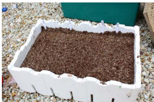
Plant them out—broccoli boxes work well