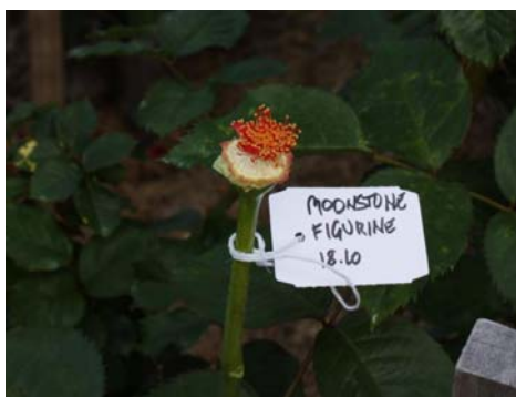
Don't be lazy! Name the parents