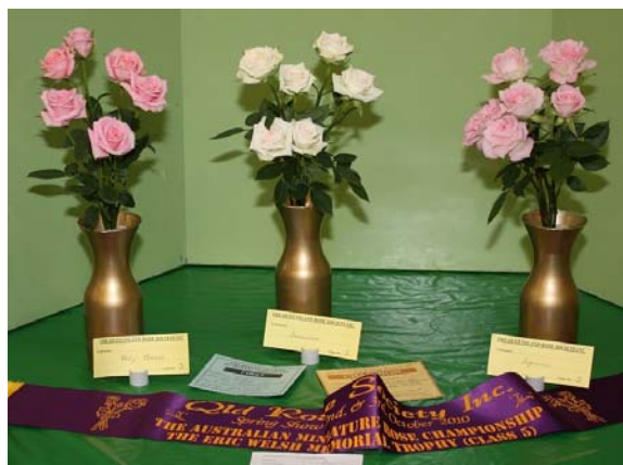
Aust Champ Class 5, Wal Stewart