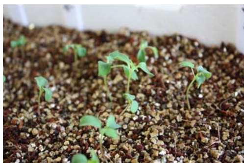
Seedlings coming up